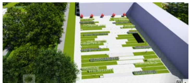
Fig 4. Design proposal for Administration building

Administration building in one of the most important buildings in our study area. In our landscape design, this space is proposed to turn into a frontage of our campus that is done by using different types and colors of shrubs and herbs which will contribute reducing temperature and permeable pavement to reduce surface runoff. Its main function is to create frontage and give an identity and increase aesthetic view. Plants those can be used here Cosmos, Rongon, Dopati, Rokto kanchon and Daisy flower.