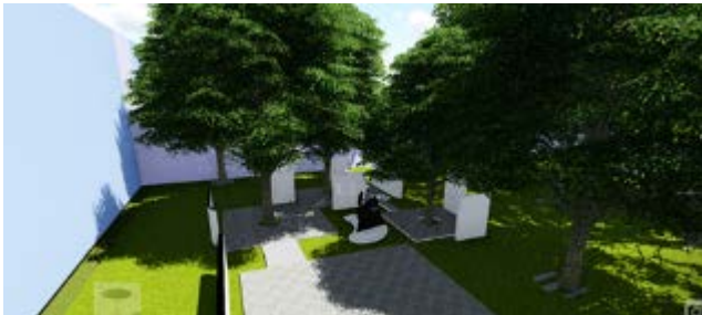
Fig 7: Design proposal for space between Civil building & Fluid and Survey Lab the space is kept open and Lab the other side can be used for the exhibition where the important and significant works of the stu-

The space that exit between Civil building & Fluid and Survey Lab is used for the purpose of surveying lab. For this one side of