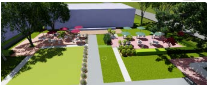
Fig 11: Design proposal for Cafeteria Front

The space that exists between Transportation & Public Health Lab and Fluid and Survey Lab and the space that exists behind the Administration building is developed by providing a food court, benches, and colorful ornamental plants so that users can feel comfortable socializing or enjoying the outdoor environment. Seasonal plant like Krishnochura, evergreen plant like Kaminy, Tecoma and Carpet grass can be used. Through all over the design, the use of impermeable hard surface was minimized.