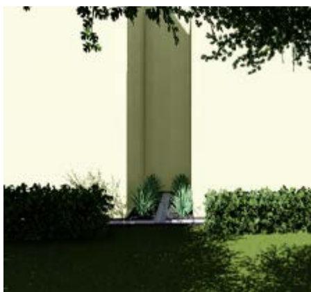
Fig 14: Pocket space