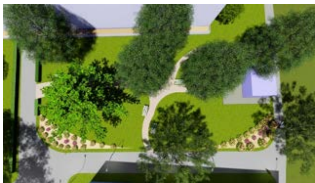
Fig 12: Design proposal for space behind Administrative building