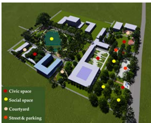
Fig 2. Layout (Administrative portion)

The vision for the proposed landscaping project in the study area was basically to provide an eco-friendly campus framework among various activity areas. To achieve this goal certain environment principles have been adopted such as water conservation, pollution control, tree preservation, wildlife conservation, soil erosion prevention, reduction of heat island, minimize resource consumption, etc. The characteristics of basic landscape principles have been attempted to obtain over all the design proposal. Proper management of waste and security have also been ensured in the design proposal. To define various functional activity areas the study area has been