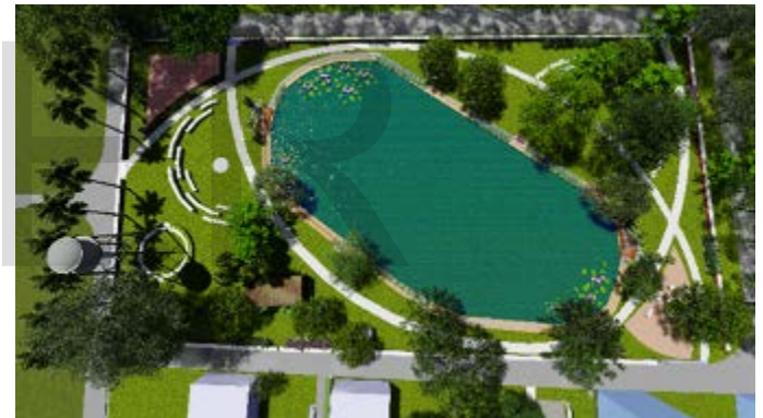
Fig 9: Design proposal for Pond

There is an existing water body which has been turned to be the main focal point of campus. This water body has been renovated to develop a unique identity. There is an existing guard room for security, water treatment plant in this place that is surrounded by shade trees and small plants to create a soothing visual effect. A permeable pathway has been proposed around the pond to provide good circulation. Different types of seating, lightings, and pergolas are provided to influence activities of the users. The existing trees like koroi and Neem are preserved for shade and drought resistance. Kadam and Krishnochura, Rakto Kanchon, Sonalu, Cosmos, Daisy, Thuja, Rongon, Eugenia can also be used in this site as an ornamental and flowering plant to make this place eco-friendly.