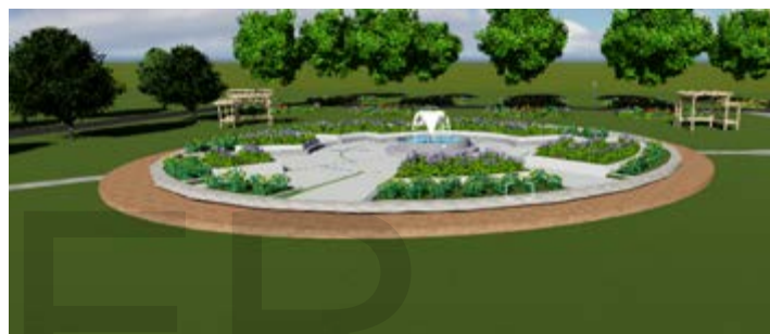
Fig 17: Fountain

Near to the building front yard and play lot a beautifully designed circular shape fountain has been proposed. It is slightly elevated from the ground that the outer circle of the fountain can be used as sitting wall. Thus the users will be able to enjoy the scenery of the area from each angle. Wedelia trilobata and Balsam (purple) are used considering the scale factor to create a harmony, which will improve and enrich the current ecology. The study team proposed blue color lights and two shaded seating to enhance activity spaces both at day and night.