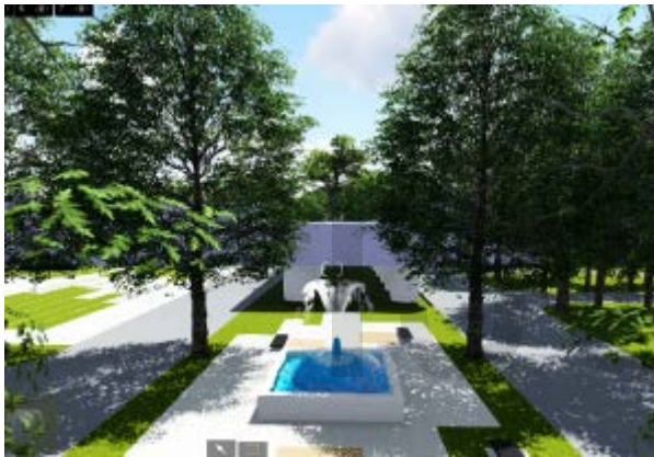
Fig 19: Design proposal for Main entrance

In residential portion, two roads got more importance for designing. The way to L.H. is one which is shaded with large Mahogany trees. At 5ft distance from the road, the study team proposed one row of Hedge along the two side of the road and China rose is proposed to be planted in between two Mahogany trees along both of the road sides. The shrub Hedge and China rose with red colored flower are proposed because they can grow up in shady areas and this portion of the site is shady because of the giant Mahogany trees. Carpet grass is also used as ground cover. The height of the hedge is 2.5ft-3ft and the row is mainly used for security which will control the free movement of outside visitors