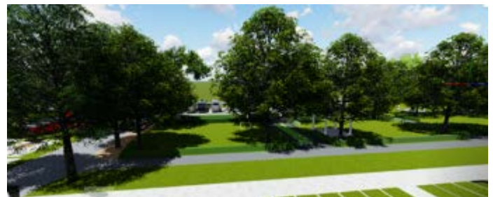
Fig 10: Design proposal for Green Square