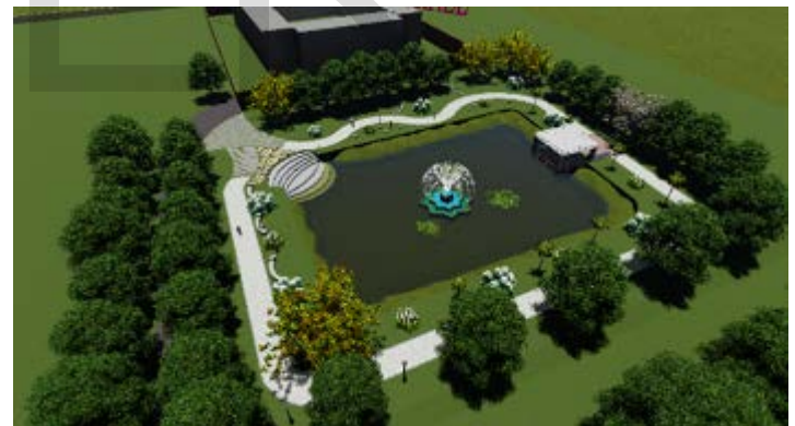
Fig 13: Pond side landscaping

As the pond is adjacent to Desh Ratna Sheikh Hasina Hall, the only Ladies Hall of RUET, it has the potentiality to be a place for recreation. Different types of seating, fountain, kiosk, etc. are provided to invite the students to spend their leisure time here and thus ensures the activity. To design for the female students requires much consideration on the security issue. The roadside portion includes a line of Thuja or Garden croton to restrict the free movement of outside visitors to ensure the safety issue. Different types of lighting are also used for safety at night. There are trash bins to collect the waste and keep the place clean. There are existing large big trees which have a great impact on the ecology; they are kept the same as before to make the design eco-friendly. Different types of shrubs are also used to enrich the ecology of the site as China rose or Jungle flame attracts the birds or other creatures. Bushes are replaced with carpet grass. A permeable walkway is provided to manage storm water and ensure more green. The adjacent wall of ladies hall is also proposed to be a green wall with Ficus pumila plant to ensure green and give the users a feeling of being more close to nature.