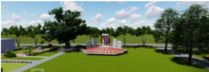
Fig 6: Design proposal for Shaheed Minar

There is a Shaheed Minar in our study area that is one of the important monuments. The front side of Shaheed Minar is known as "MUKTO MANCHO" that is surrounded by large trees such as Krishnochura and Kadam that will improve physical and chemical properties of soil and increases the level of soil organic carbon cation-exchange capacity. Besides this Debbaru, Neem, Sonalu are the existing trees that will be preserved and this open space will be used to organize different cultural programs or national days of our country on the campus.