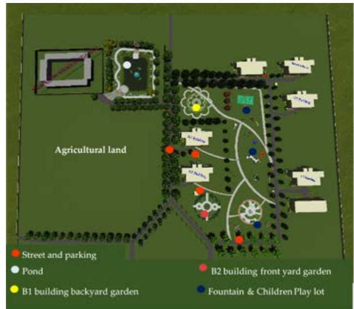
Fig 3. Layout (Residential portion)

divided into several zones based on their distinctive operational characteristics. They are – Civic Space, Social space, Courtyard, Residential area Street & parking. Each zone has been designed carefully according to those principles.