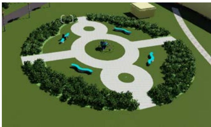
Fig 15: Front yard garden

The B2 building front yard garden is designed from the concept of the meditation garden. So green, blue and purple color is mainly used. Seasonal effect is also taken under consideration. Cosmos and Botam plants are used in two layers centering the flower vase. The flowering season of cosmos plant is winter where the Botam flower blooms in summer and rainy season; so there will be any of the plants bloomed with the flower of purple color throughout the year. Blue colored concrete made curved seating which gives a balanced look with the curve of the pattern of the garden, ensures the activity. People can sit here in a calm and cool environment and enjoy some time for himself. The Kufiya plant is used because of its small scale growth and the green herb with blue flowers. The walkway is brick made and includes carpet grass at the middle of the bricks. Green color light has been used in the garden to beautify the night view of the site at the same time for the mental freshness of the residents who will sit in the garden.