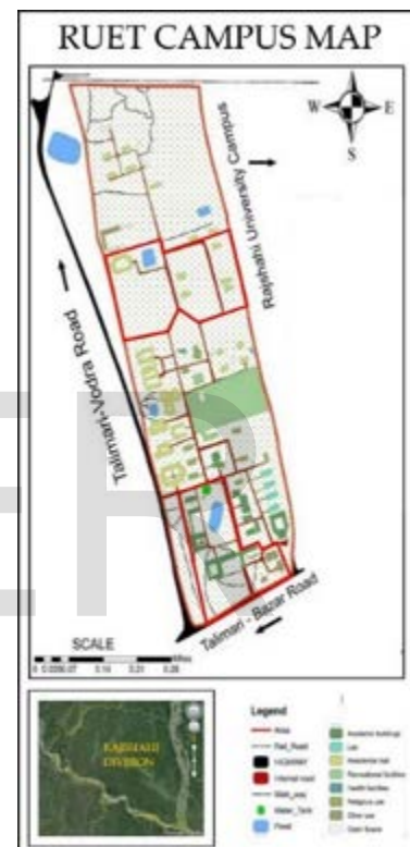
Fig1. Study Area

the principles & guidelines described in the following design ideology section. Some of the conventional principles have been reformulated to meet the location criteria. Eco-friendly design guidelines have been taken into special consideration in the design process. A 2-D sketch of conceptual framework has been designed following the comprehensive set of principles. It was modified several times after conducting a second site inventory and analysis. A final design proposal has been prepared and projected into a 3-D model form afterward. Finally, to ensure proper and efficient management of the project, a detailed report has been submitted as the documentation of the whole procedure.